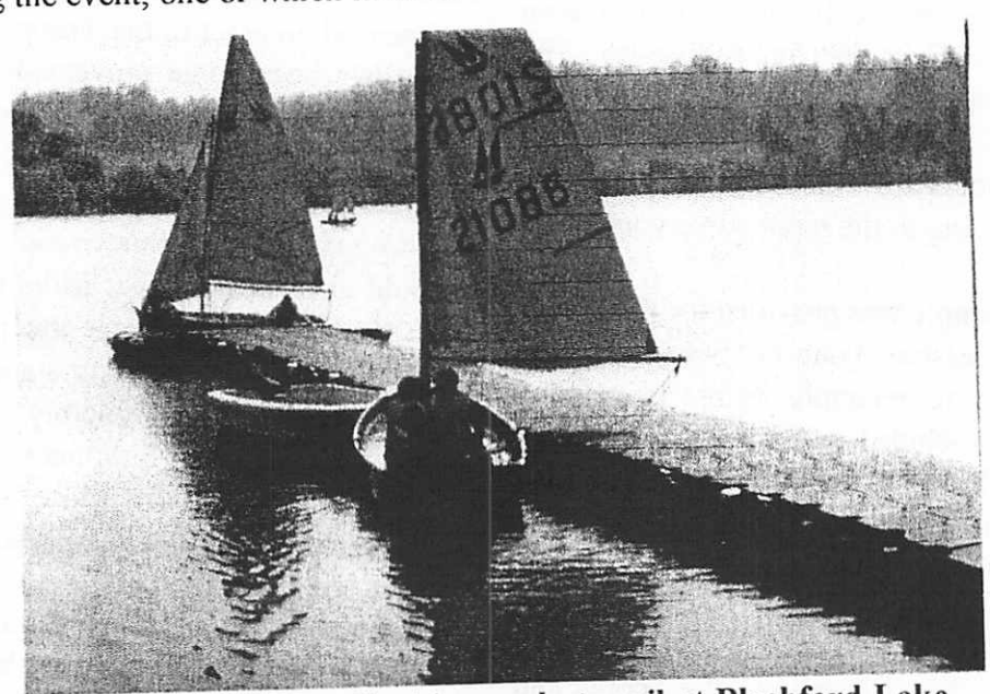
Sandleheath Mirror dinghies ready to sail at Blashford Lake.