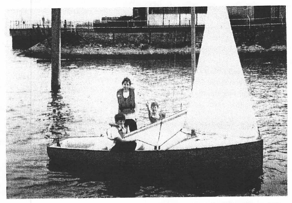
A Sandleheath Crew returning from a successful race at the Marchwood Regatta.