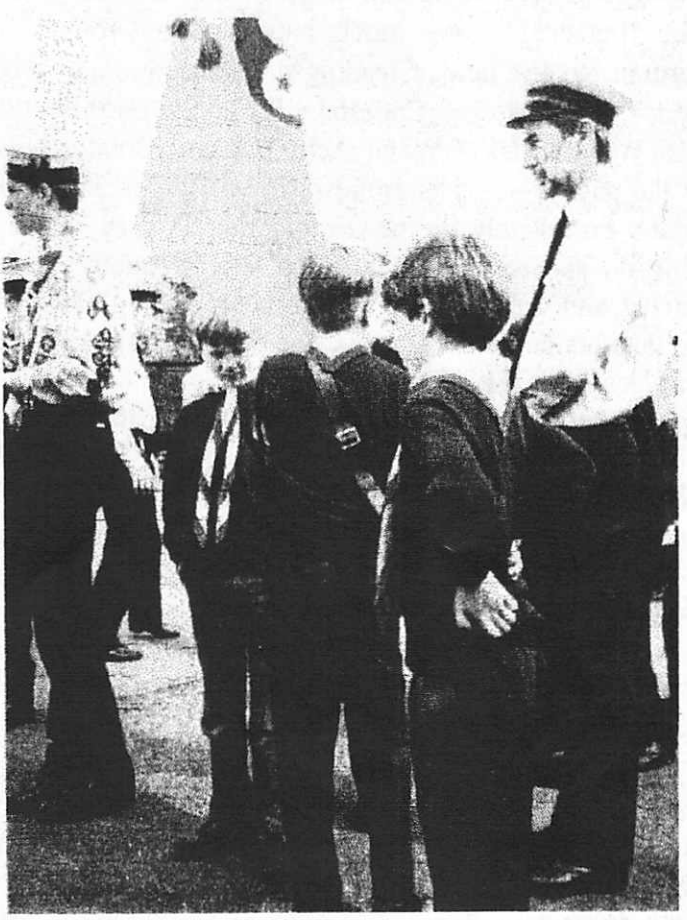
Ready for parade?! Prehaps not the most fun events in the year - but its nice to see the committment shown by the boys.

First of all I will explain our situation. Scout Groups exist to help young people - to help them learn to work together, to promote their mental and physical development, to help them learn about how to be a useful part of the groups or groupings they are part of and to encourage spiritual awareness. An awesome task! To do this we have unpaid volunteers, who think that the aims of scouting are worthwhile. Their reward is to observe the development of the young people they are trying to help. Any money required