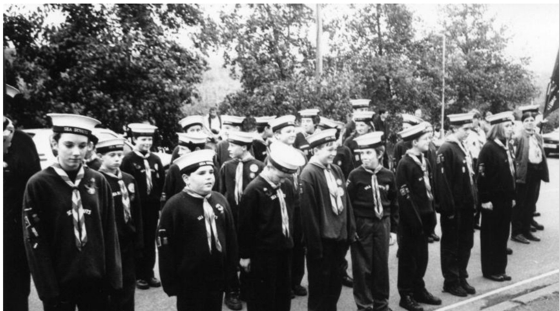
The Scouts assemble for Remembrance Day Parade

Thank you to the New HQ team you are about to make history with this lottery application. We are all waiting