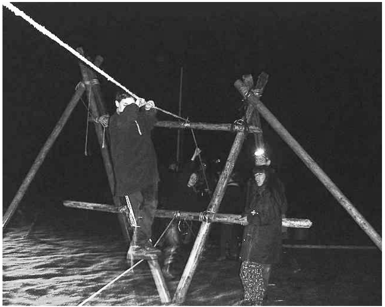
Pioneering: constructing a monkey bridge in the field.

the forest and bonfires and barbecues (Scouts seem happiest when allowed to set fire to things and eat the results!). We have had a cycle ride, caving trips, swimming sessions and an indoor climbing session.