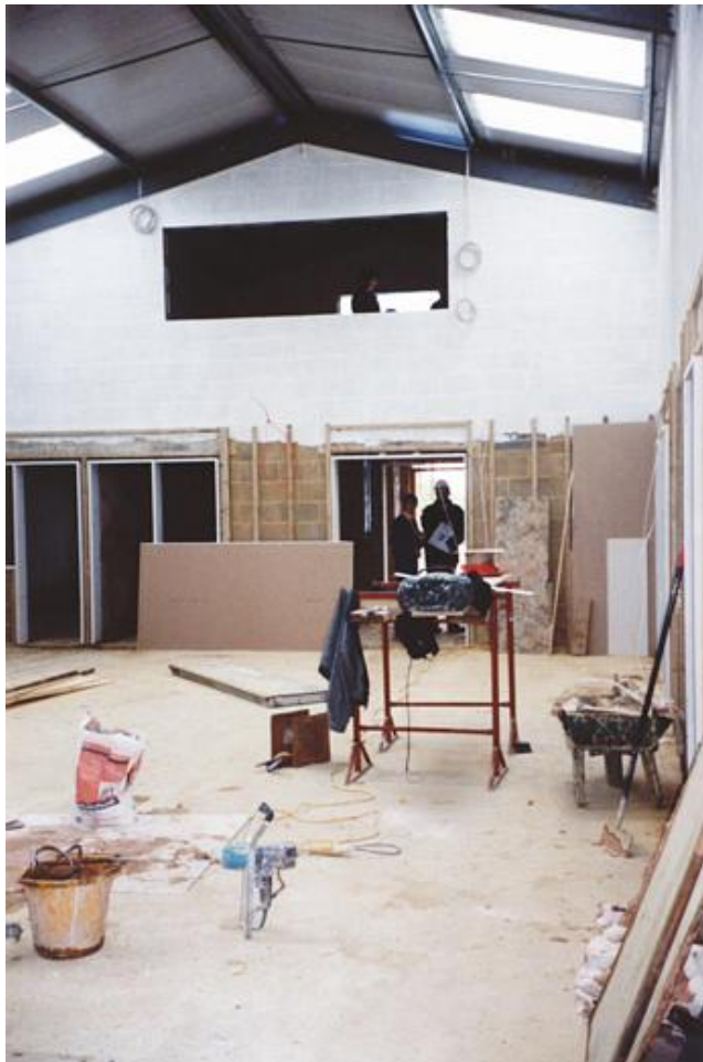
The main hall in the new H.Q. (looking South)

Our new headquarters, “Sandleheath Scout Center”, is well on it’s way to completion in early June. South Coast Construction have told us they are on target to complete the works and the building is looking fantastic. The building will be officially opened on Saturday 6th July at 6:30pm. All are welcome. There will be a Hog Roast and Barbecue.