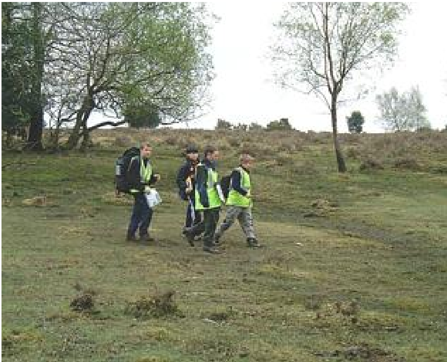
Above: Scouts between bases on the Pat Cross Trophy incident hike

Below: evacuating the casualty after the rescue