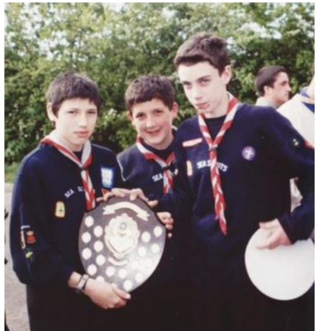
Sandleheath Scouts with the Pat Cross Trophy