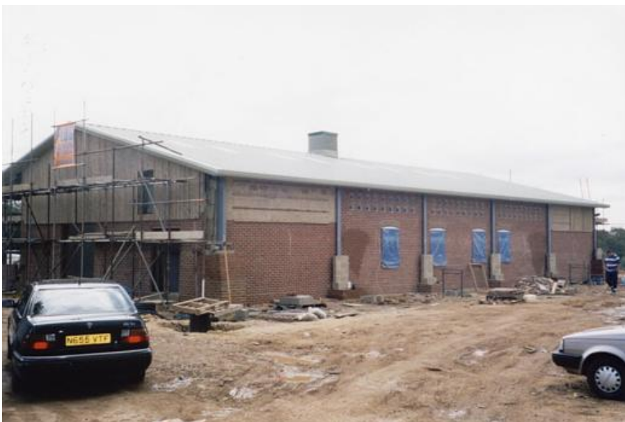
The new headquarters